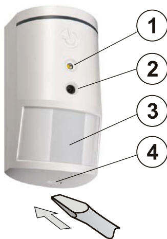
Figure: 1 – flash for illumination; 2 – camera lens; 3 – PIR detector lens; 4 – cover tab;

The detector can be installed onto a wall or in the corner of a room. There should be no objects which quickly change temperature (electric heaters, gas appliances, etc.) or which move (e.g. curtains hanging above a radiator) or pets in the detector's field of sight. It is not recommended to install the detector opposite windows or floodlights or in places with over-intense air circulation (close to ventilators, heat sources, air conditioning outlets, unsealed doors, etc.). There should be no obstacles in front of the detector which might obstruct its view.